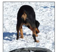
... tail end