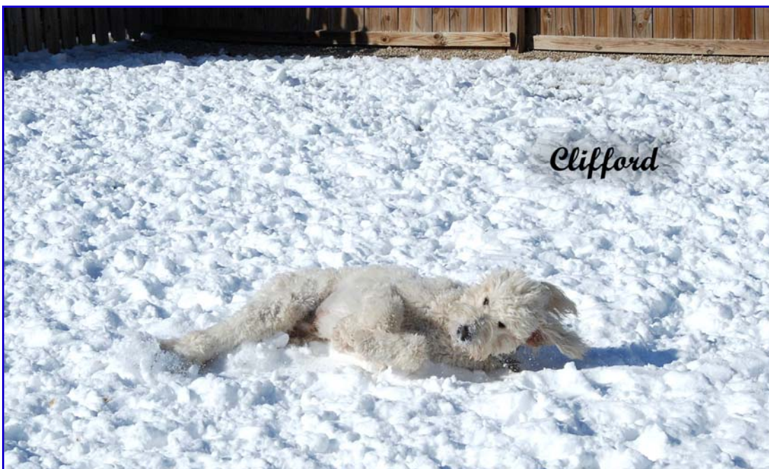
Last "snow day".

Together we can keep Caninea Dog Park a clean and welcome place for all our dogs.